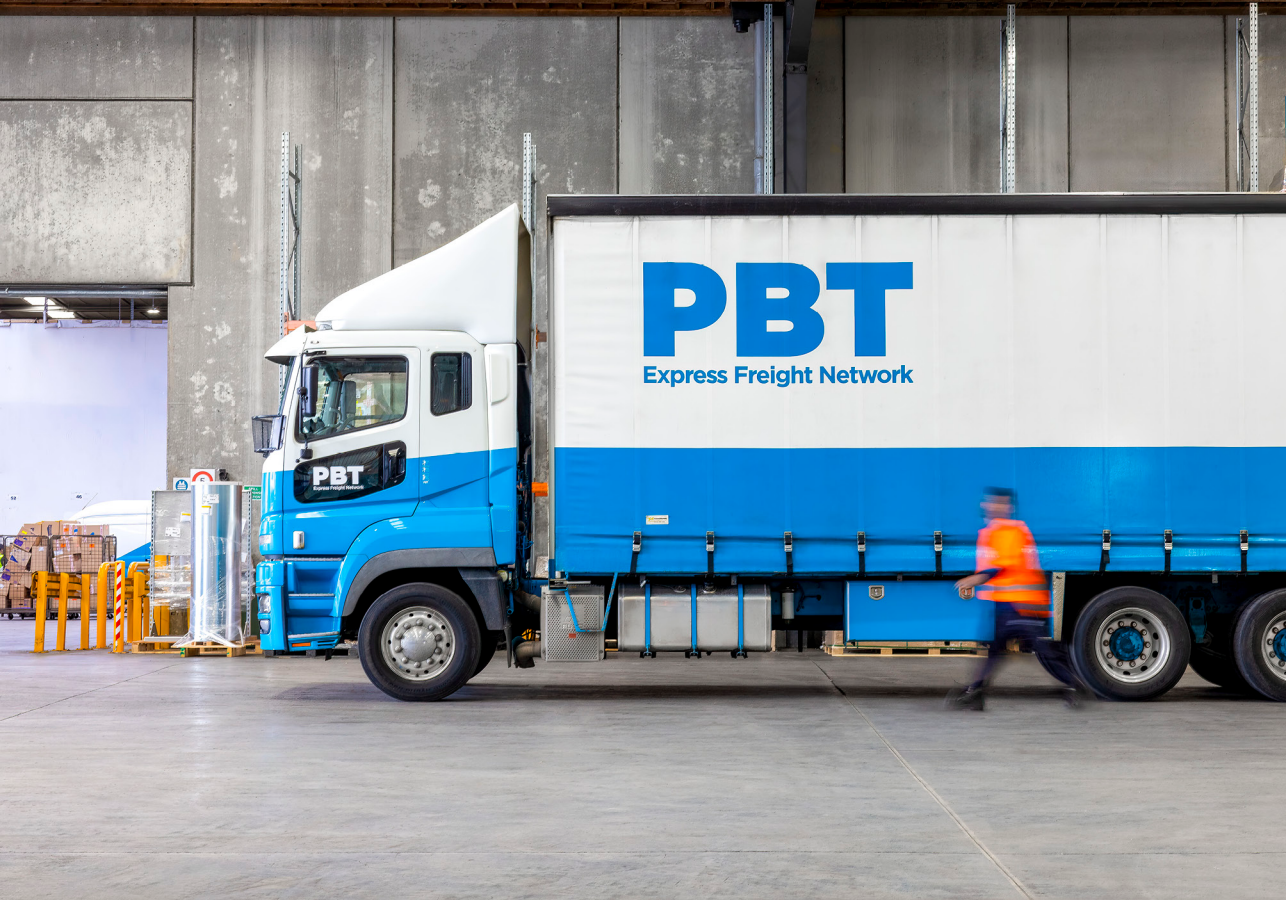
Top 99 Kyber Pass Road Auckland | Below 12-20 Bell Avenue Auckland

Argosy Property Limited Annual Report 2024 02